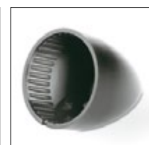
Tilted mounting Easy installation