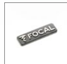
Focal logo (aluminium -diamond cutting)