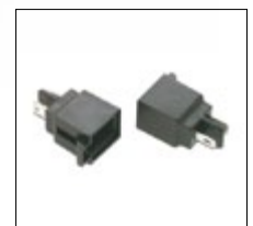
ISO connector (woofer)