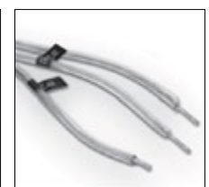
Assembly options: car and display